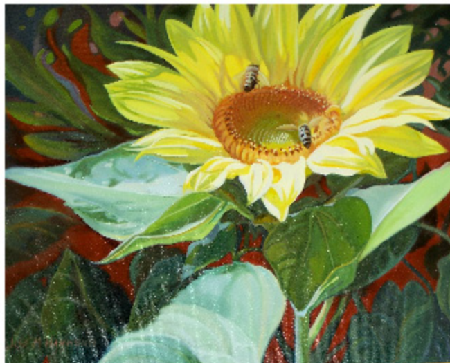
Above: "Sunflower with Bees" second place, 2-D. Oil by Elise Hammond