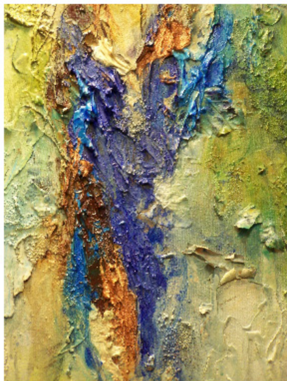
Right: "Stratum" first place, 2-D, acrylic by Rosalind Webb