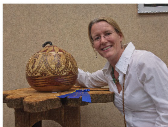
3-D First Place, carved gourd "Spirit Dance" with