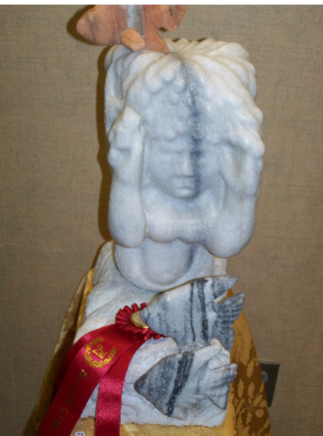
Mermaid in Aquarium , A marble Sculpture by Ray Salvatore, took 2nd Place in 3-D Category.