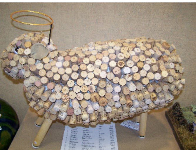
Below, A pastel depiction of a fair by Cameron Hampton