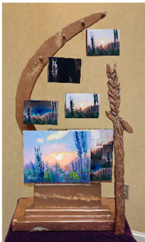
Best in Show, "Wheat Dreams"